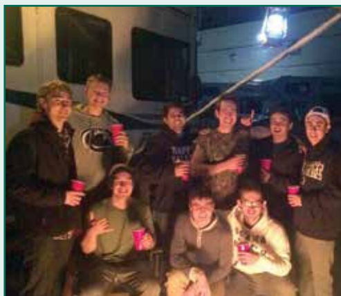
Brothers bond around the campfire on their trip to Ann Arbor.