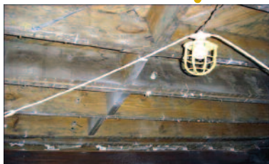
A temporary light hangs by a crack in the rafters that is causing the ceiling and second floor hallway to sag.

Piping from the third floor is severely plugged. This is similar to all drain pipes in the house and has led to much of the water damage.