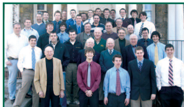
Alumni and undergraduates gather at the chapter house for Founders Day.