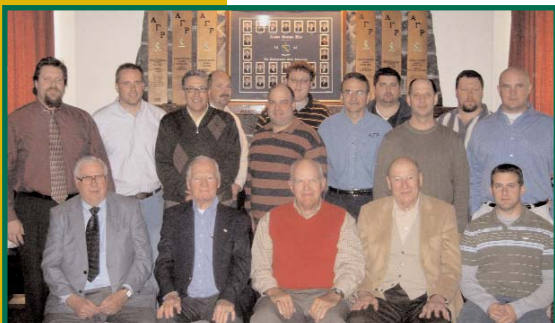
AGR alumni gathered in Great Hall during Founder's Day 2008.

It is truly amazing to see how many of us are out there from different generations and at different points in our lives. Yet we still have one common interest, not to just have a home on 322 Fraternity Row, but what it means to be a Gamma. I encourage you to help or visit the house to show your support in our endeavors.