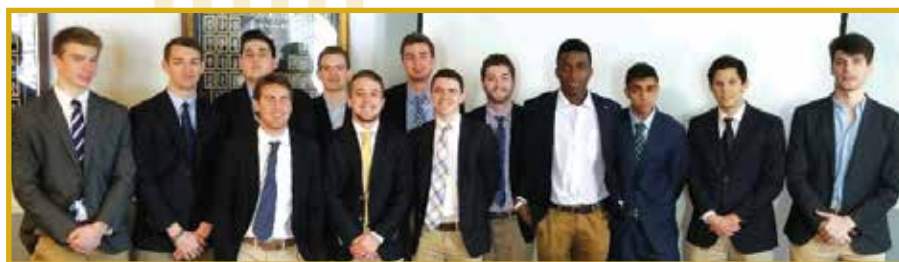
Thirteen of the 23 new members to join the Alpha Gamma Rho brotherhood at Penn State.