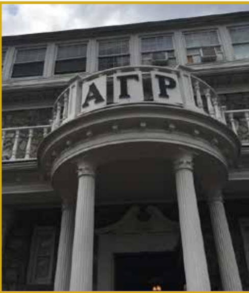
The Gamma chapter house remains in good condition thanks to our loyal alumni and undergraduate brothers.

PSRST STD U.S. POSTAGE PAID LAWRENCE, KS 66044 PERMIT #570