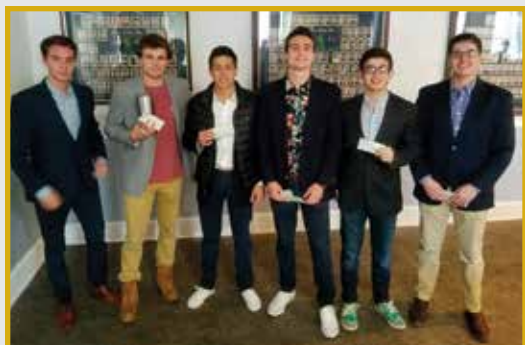
Six of the 36 Gamma members who made Penn State's dean's list for the fall 2017 semester.

Gamma Chapter is at an all-time high academically. Gamma has the second-highest percentage of brothers above a cumulative 3.0 GPA at 80.9%. Gamma also has the second-lowest percentage of brothers under a cumulative 2.5 GPA at just 5.9%. The new member class of six had a GPA of 3.55, which is absolutely phenomenal.