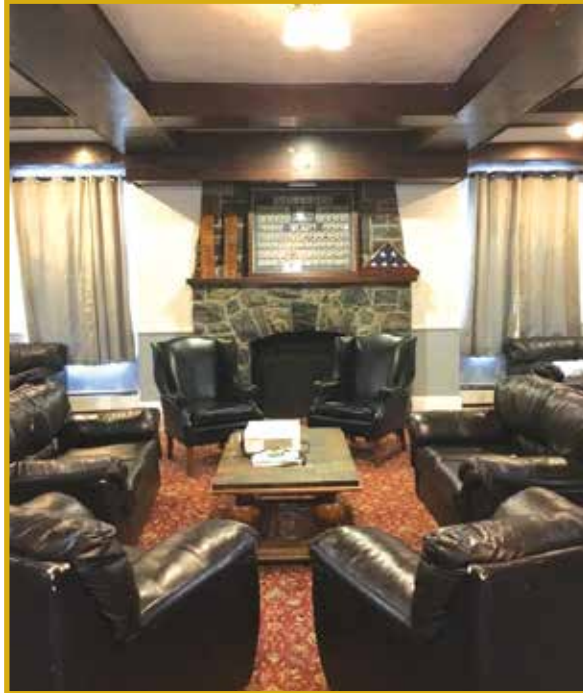
Our home at 322 Fraternity Row this spring.