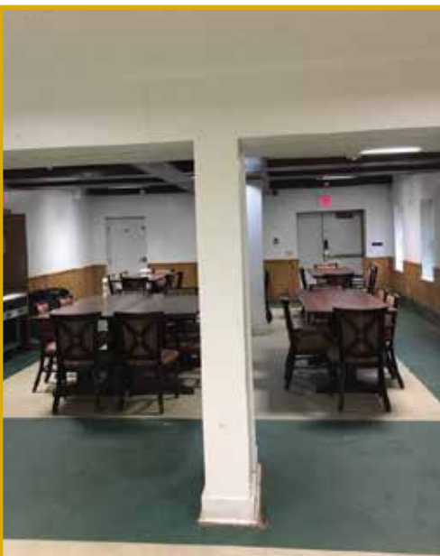
The dining room at the Gamma chapter house.

ATTENTION: This newsletter is intended for alumni, undergraduates, and parents. If your son is still attending Penn State, he will receive a copy at the chapter house. If he has graduated, please send us his permanent address to update our records. Thank you.