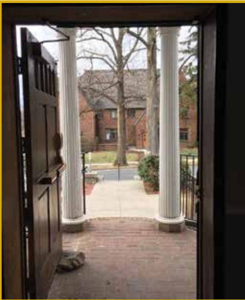
The view of Fraternity Row from the front door of the chapter house.