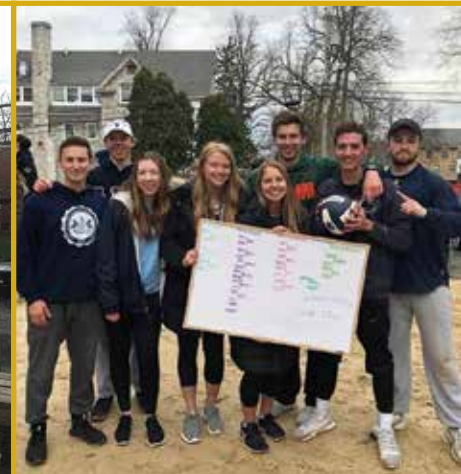
(Left, middle) Gamma Chapter members enjoy an afternoon outside of the chapter house this spring. (Right) Undergraduates after winning the Greek Week volleyball championship this spring.