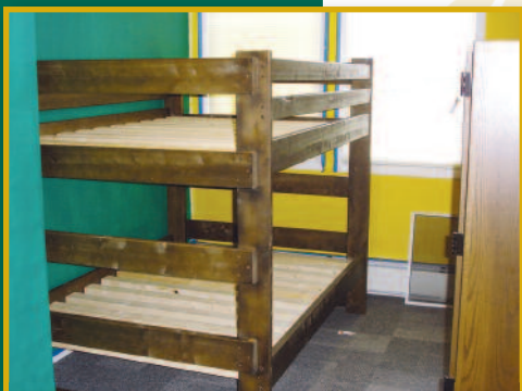
The student bedrooms were renovated.

Thanks to our donors, phase one of the renovation of our great house has been completed. Our chapter house is nearly 100 years old, and we are thrilled to return it to its former glory. The chapter members have moved back in, and we will have an open house on November 13 to celebrate completing phase one. Please see page 4 for more details.