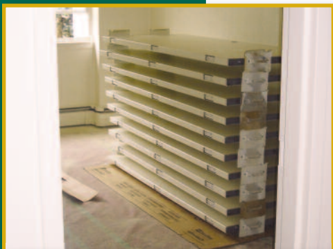
Along with installing a fire-suppression system, fire-safe doors were installed.